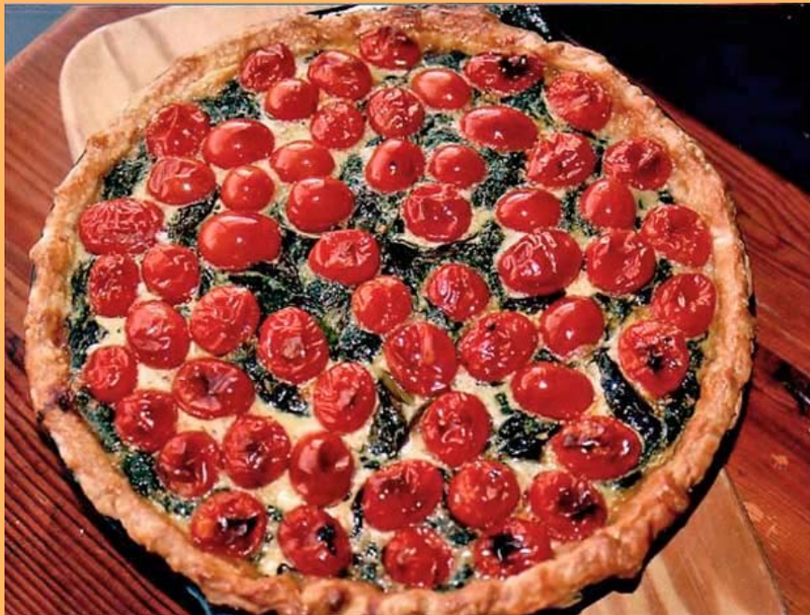
Tomato, Spinach, and Spring Onion Pie